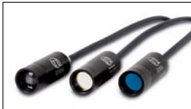
PLS Series Sub-nanosecond pulsed LEDs

Available wavelengths: 375-510 nm, 530 nm and 635-1990 nm, options: peltier cooled, high power version, narrow spectral bandwidth, selected short pulses, fiber coupling to singlemode and multimode optical fibres