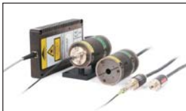
LDH-P/FA Series Picosecond pulsed laser diode heads

Available wavelengths: 375-510 nm, 530 nm and 635-1990 nm, options: peltier cooled, high power version, narrow spectral bandwidth, selected short pulses, fiber coupling to singlemode and multimode optical fibres